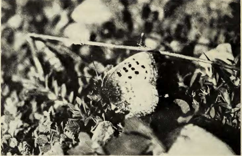
Fig. 4. Female of Tomares mauretanicus LUCAS warming up in the early morning sunshine, Imouzzet-du-Kandar, Middle Atlas (nr. 17 on the map).